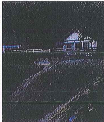
Actual photos of homes and businesses saved by Thermo-Gel .